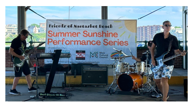
Dust Clouds of Mars performs at the Bernie King Pavilion.