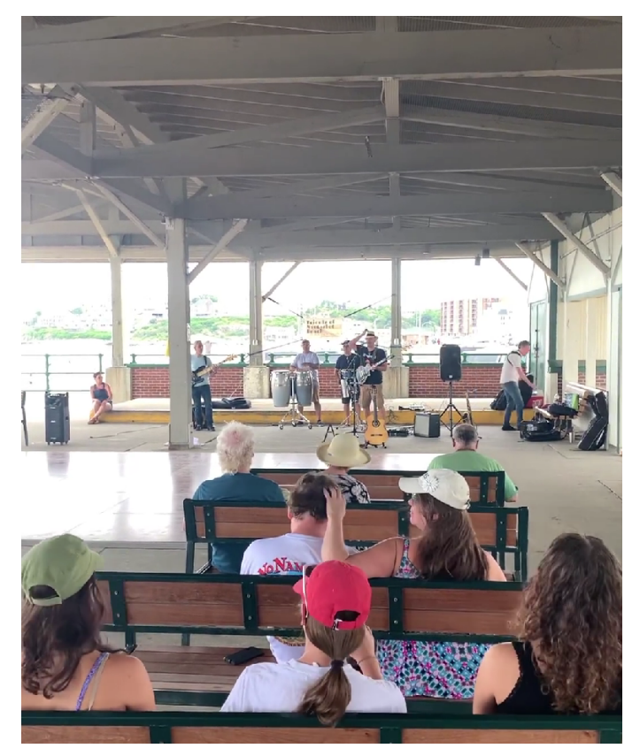
Audience members enjoy a performance from Los Gallos Locos.